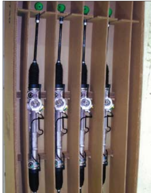
Automotive components packaged in corrugated Cortec® CorrTainer ™.