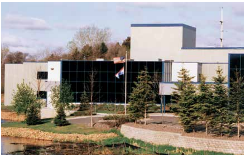
Cortec® Corporation's World Headquarters Committed to nature's preservation