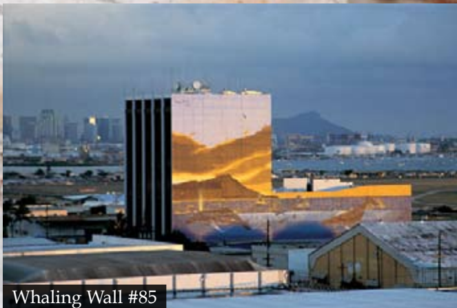
Whaling Wall #85