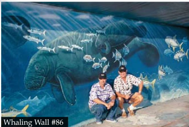
Whaling Wall #86