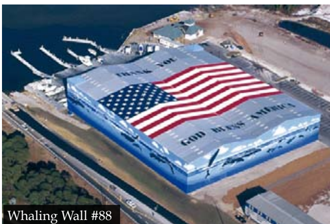
Whaling Wall #88