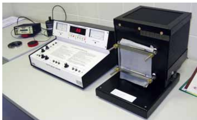
Eco-Corr® ESD: Static Decay testing at Cortec Laboratories