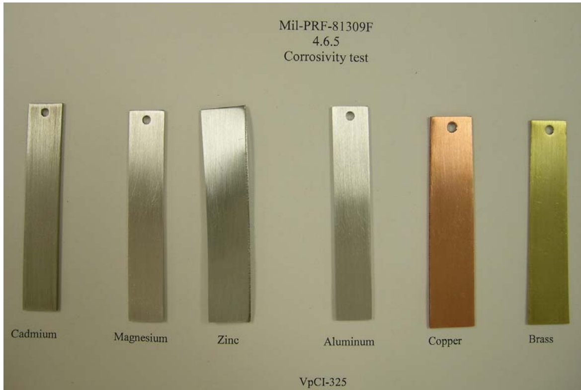
Figure 1. Specimens that were immersed in VpCI-325, after 1 week. Notice that all specimens display no corrosion.

1/ Unacceptable corrosion is not more than three rust spots less than 1 mm in diameter, excluding the area within 1/8 inch of the panel edges or hole.