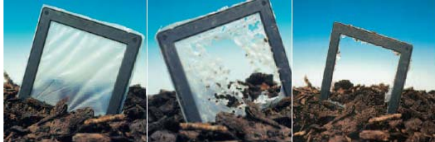
Figure #3, shows prior to insertion into compost pile, after three weeks in compost pile and after six weeks in compost pile. Less than 10% of the original weight of the film is remaining after six weeks in compost pile [11].