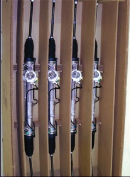
Automotive components packaged in corrugated product made with Cor-Pak® VpCl™ Linerboard.