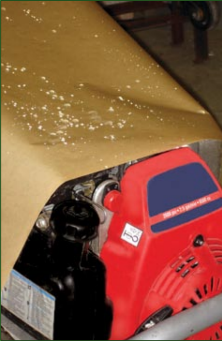
Small engine packed in VpCI™-144 paper.

Cortec® VpCI™ papers are simple to use: There are no chemical concentrations to calculate or application systems to maintain, and your products can be used immediately – no surface preparation or cleaning is required.