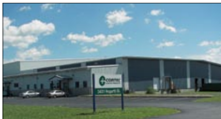
Cortec Coated Products, Eau Claire, WI