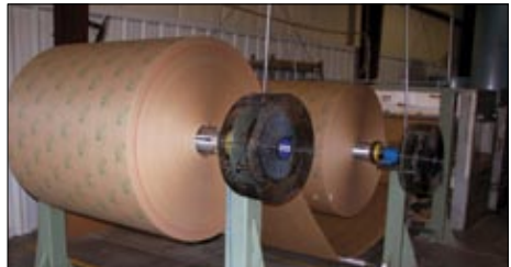
Unwind Station for the Slasher