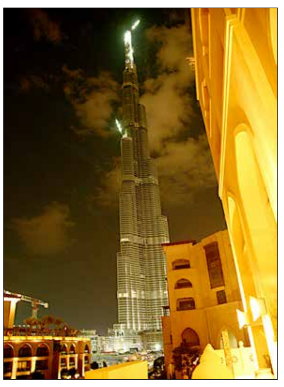
Case History #310: "BURJ KHALIFA TOWER (Burj Dubai) - The World's Tallest Building"