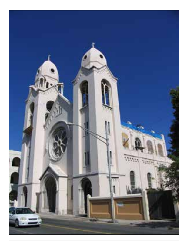
Case History #349: "Repair of San Agustin Church"

To view more Cortec<sup>®</sup> case histories, please visit: http://www.corteccasehistories.com/