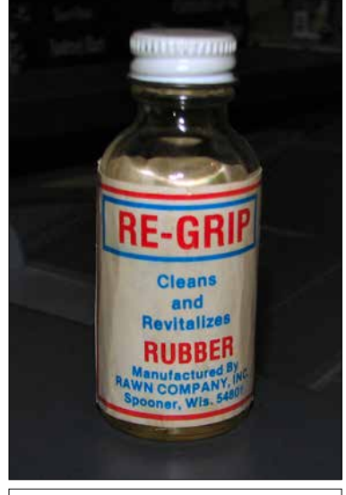
Case History #407: "30+ Year Old Product Still Works!"

Case History #449: "Reconstruction of Zagreb Cathedral with VpCI® CorrVerter®"