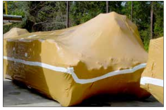
Case History #339: "MilCorr®: Tough Enough for Three Hurricanes"