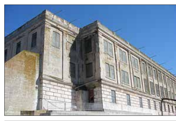
Case History #376: "Emergency Stabilization of Alcatraz"