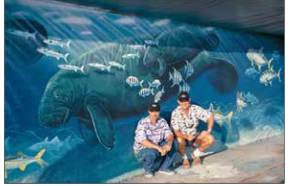
Case History #285: "World Renown Wyland Murals Protected with Cortec's MCI® Architectural Coating"