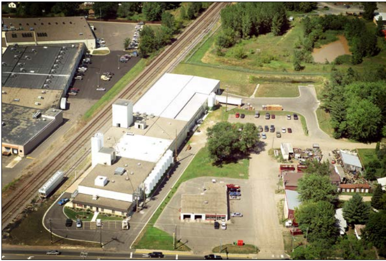
Located in Cambridge, Minnesota, Cortec® Advanced Films is the largest state of the art film producing facility globally.

corrosive elements such as humidity and high chlorides. When the package is opened, the VpCI® molecules disperse, leaving the metal part or equipment ready to use. This results in a dry, economical, and easy to use packaging and preservation method.