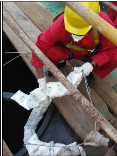
Inserting Cortec® EcoPouches™

Within the preservation process, Cortec's ready-to-use waterborne corrosion inhibitor VpCI®-337 BD was used primarily for robust prevention of internal void spaces while simultaneously preventing bio-growth. The inhibitor was sprayed in the caisson legs to stop bio-growth. After that water-soluble, biodegradable powder VpCI®-609 S was fogged in to the void space to counter dead volume of water at the bottom. Custom manufactured strips of Cortec's easy to use EcoPouch were then suspended from the top side for additional protection. EcoPouches are filled with VpCI®-609 powder and constructed from breathable Tyvek®, which allows the