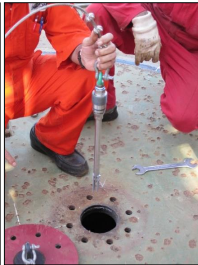
Application of corrosion coupons

The results showed strong improvement in the VpCI®- treated caisson leg where corrosion rates were maintained at low rates that were deemed acceptable. The methodology was adopted for the treatment of all other caisson legs at the complex. After two years, the pilot project was deemed a success and Cortec® VpCI® inhibitors were proven to effectively mitigate corrosion in an offshore environment by reducing the corrosion rate in the protected leg Vs the control by 584%.