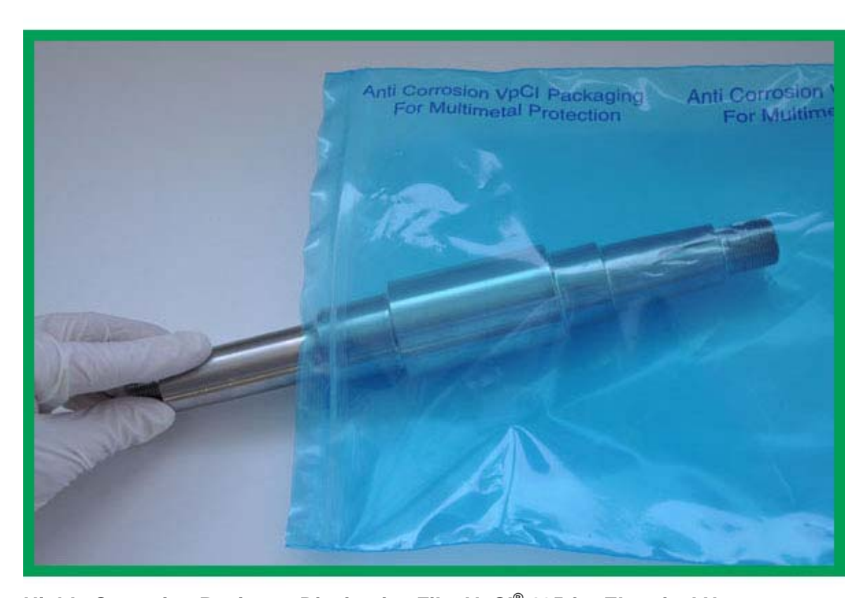
Highly Corrosion Resistant Dissipative Film VpCI® 125 for Electrical Use

The product conforms to NACE Standard RP0487-2000 Item #21037, MIL-PRF - 22019D, according to the Naval Air Warfare Center Aircraft Division, QPL 13600 Ser 43500B120- 3/531. In addition, VpCI-126 is referenced in TO 1-1-686, TM 55-1500-331-34, NAVAIR 15-01-4 and is RoHS compliant. The product is described in patents US 5855975, EP 0653454, and AU 675317.