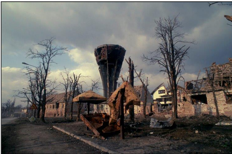
During the War of Independence Croatian city of Vukovar suffered hardest atrocities in modern European history

Product named MCI®-2020, which was donated to the City of Vukovar was used for renovation of Pentagon building after the terrorist attacks on September 11, 2001. The project won first prize for the rehabilitation of infrastructure in the United States given by International Concrete Repair Institute.