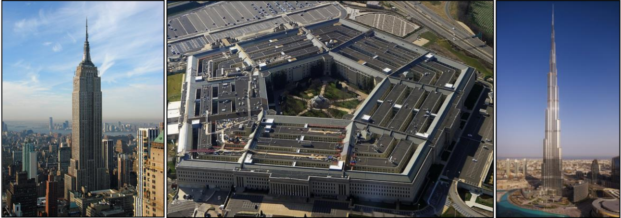
MCI® technology is utilized worldwide for the construction and rehabilitation of world most famous building structures such as the Empire State Building, Pentagon and Dubai's Burj Khalifa, tallest tower in the world.

Cortec's patented MCI® (Migrating Corrosion Inhibitors) technology protects reinforcing metal in concrete from corrosion. It rehabilitates existing concrete structures and extends the life span of new structures. This world proven, contemporary technology will be used for restoration of Vukovar tower and will preserve the monument symbolizing suffering and heroism of Croatian people for future generations