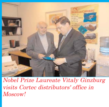
Nobel Prize Laureate Vitaly Ginzburg visits Cortec distributors' office in Moscow!

The Cortec Laboratory will go to great lengths to answer questions and provide technical support for Cortec products, sometimes as far as 4911 miles. While the lab performs most of our work inside the Cortec world headquarters, sometimes travel is required and 2004 was no exception.