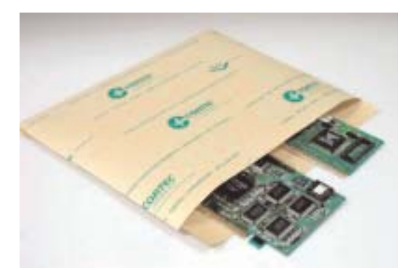
VpCI <sup>®</sup>-145 Static Dissipative Paper protects against static electricity damage and corrosion using a coating derived from soybean oil.