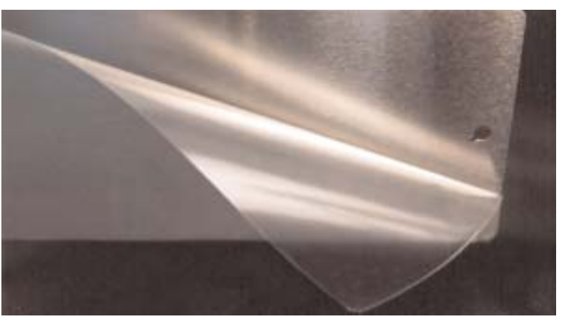
Cor-Pak® VpCI® Masking Film provides surface protection and corrosion inhibition in a removable adhesive film.

Examples of masking film are seen everywhere these days. Automobile manufacturers use a white opaque film to protect the paint on cars in transit. The film is removed by the dealer prior to display on the lot. Consumer electronics are sold with masking film in place over both plastic and metal surfaces to prevent scratching during shipping. This film is most often removed by the consumer.