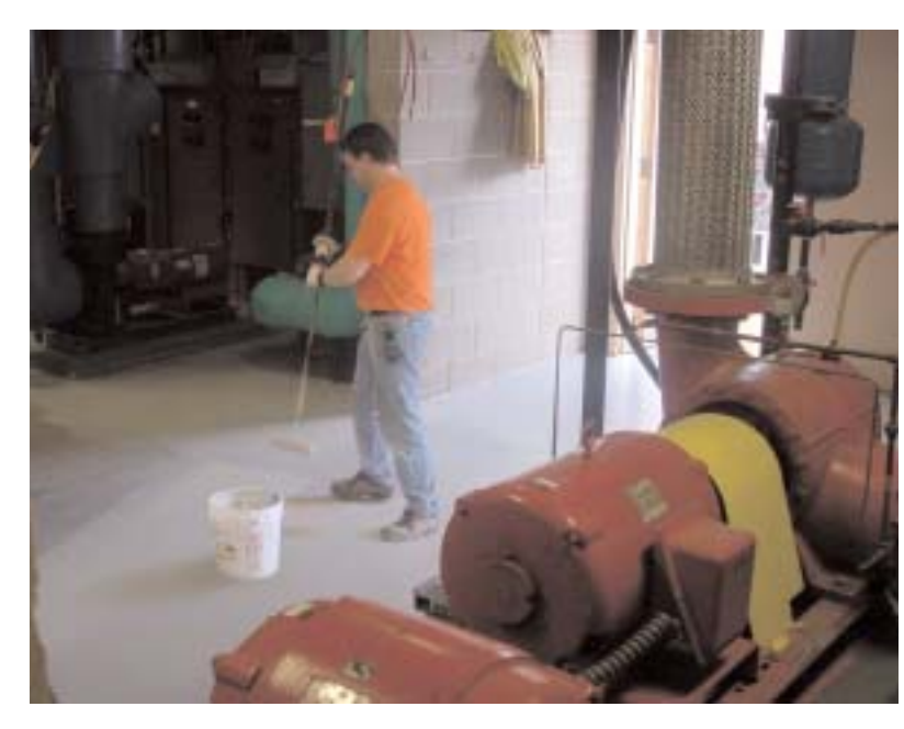
MCI <sup>®</sup>-2026 Flooring System combines the strength of our concrete primer and floor coating.

The first product MCI<sup>®</sup>-2020, will migrate through the concrete, attach itself to the surface of reinforcing steel, and significantly prolong the time before steel rebars would corrode and cause cracks in the concrete. The second product - MCI<sup>®</sup>-2026 Concrete Primer, is a two component water-based epoxy primer. It retains excellent adhesion even to damp concrete, good abra-