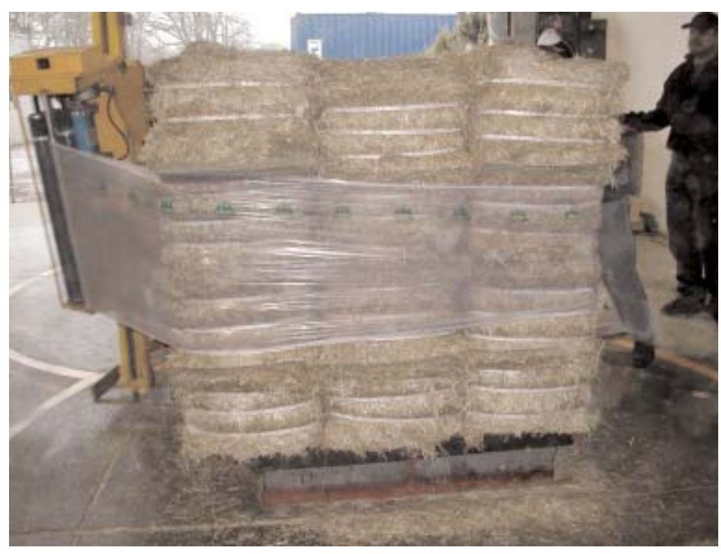
Eco Wrap^{M} stretch film provides superior strength and performance. This film will biodegrade completely in a couple of months without leaving any harmful residue.

But Eco Wrap<sup>™</sup> is more than a stretch film alternative, it can also be used for masking applications and mechanical protection. Eco Wrap<sup>™</sup> uses controlled adhesion to stick firmly to smooth surfaces and leaves no residue upon removal.