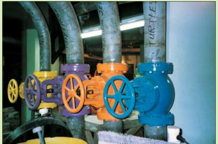
VpCI™-375 offers extended protection, there is no sagging or running when applied.

VpCI™-375 can be used on a variety of metals: carbon steel, aluminum, stainless steel, and galvanized steel. The standard color of VpCI™-375 is white, but this product can be made in any color requested by the customer.