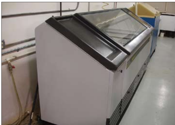
CCX Advanced Cyclic Corrosion Cabinet

An additional capability that Cortec® Labs will have during testing with the CCT-NC-40 is adjustable and controllable relative humidity, SO 2 injection to simulate industrial pollution, digital readout capabilities, and remote trouble shooting. In addition to GM 9540P, other industry standard tests that Cortec® will be able to perform include: ASTM-G-85 A1, A2, and A3, Prohesion, ASTM D 1735, ASTM B368, and ASTM D 2247.