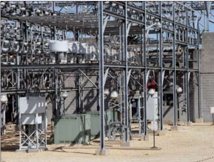
VpCI™-371 is an excellent product for power generators because of its high heat resistance.

VpCI™-371 is a fast drying, high solids, low viscosity coating. It passes ASTM D-2485-91 “Standard Test Methods For Evaluating Coatings For High Temperature Services” (Method A and B).