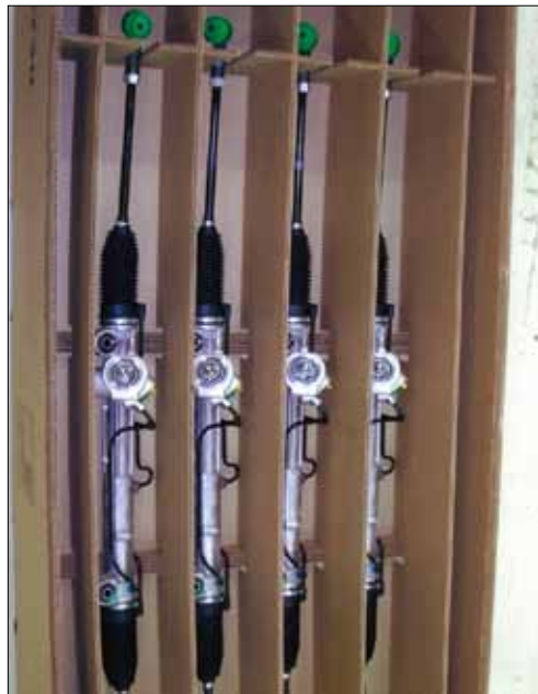
Automotive components packaged in corrugated Cortec® CorrTainer ®.