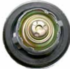
Fuel treated with VpCI-705 Bio