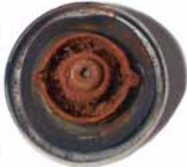
Without VpCI-705 Bio