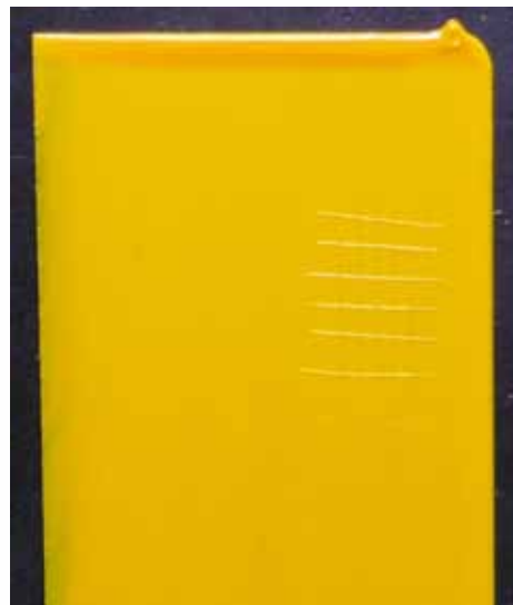
Panel cleaned with VpCI-429 and then coated with VpCI-386 Yellow