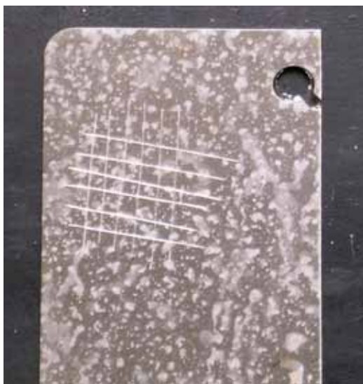
Panel cleaned with VpCI-429 and then coated with VpCI-386 Clear