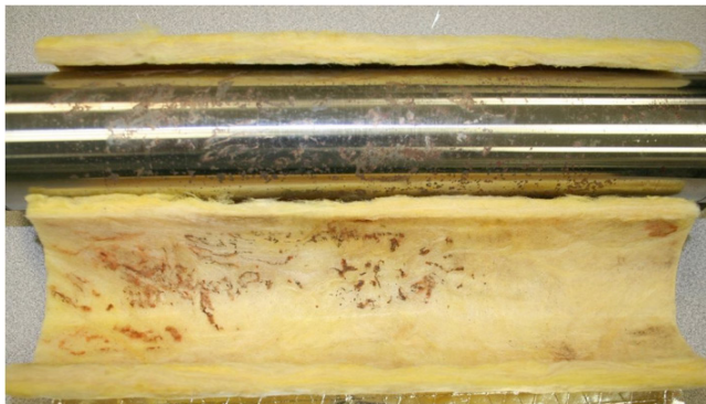
Unprotected pipe, after 240 hours of testing in high temperature conditions with regular chloride injection.