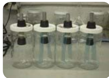
FIGURE 2 VIA test setup with VCI film.