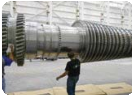
FIGURE 12 Rotor being cleaned prior to preservation.