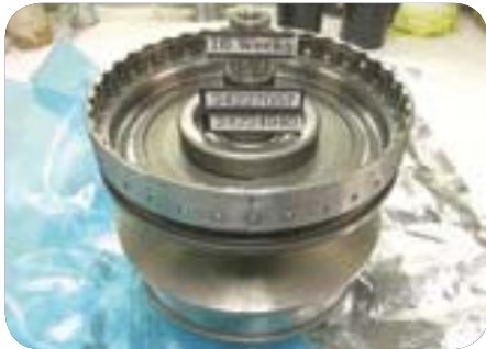
FIGURE 5 Automotive transmission component after 16 weeks in modified ASTM D1748 testing, wrapped in VCI film.