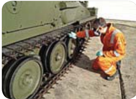
FIGURE 6 VCI aerosol used to protect combat vehicle reconnaissance (CVR) wheels. VCI additives were also used in the fuel, coolant, engine, gearbox, drive, and brake systems.