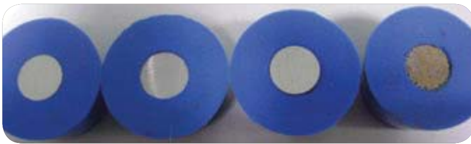
FIGURE 3 VIA test results with VCI shrink film. Control plug is on the far right.