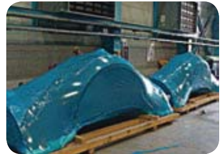
FIGURE 11 Gas turbine shells, after preservation with VCI shrink film.