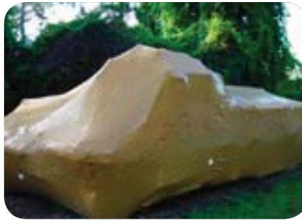
FIGURE 8 United States Air Force cargo loader, preserved with VCI shrink film.