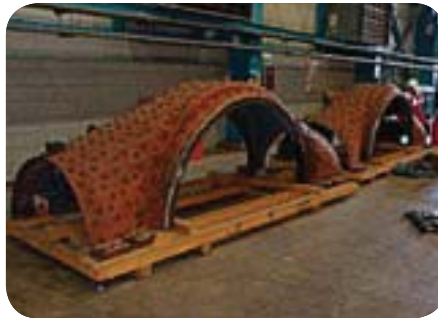
FIGURE 10 Gas turbine shells, prior to preservation.