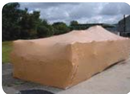
FIGURE 1 Fully preserved military equipment using an integrated VCI system.