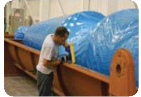
FIGURE 13 VCI shrink film being applied to rotor.