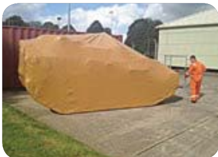
FIGURE 7 CVR wrapped in VCI shrink film, in place for final preservation.

lowing: a single-layer VCI film, a multi-layer VCI film, or a standard foil barrier film. After being wrapped, components were exposed to modified ASTM D1748 14 conditions. Test conditions were 49 °C (120 °F) and constant condensing humidity, per ASTM D1748. However, the test was much larger than that of the standard, in order to allow the number and size of components to be tested. As such, the wrapped components were not in constant rotation, per the standard. Parts were removed, unwrapped, visually inspected, and photographed on a four-week schedule, for a total of 20 weeks (Figure 5).