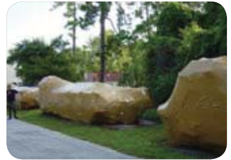
FIGURE 9 Three United States Air Force cargo loaders, preserved with VCI shrink film.