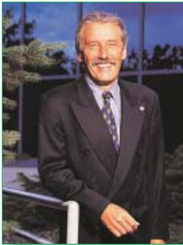
Ernst & Young LLC Master Entrepreneur of The Year®