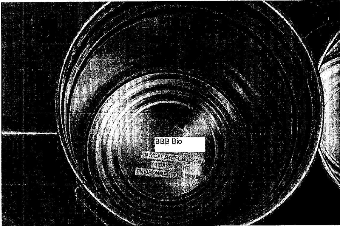
Figure 1: Steel Bucket protected by BBB Bio after 14 days in the Environmental Chamber with the same relative humidity and temperature as utilized for ASTM-D-1748 [8]