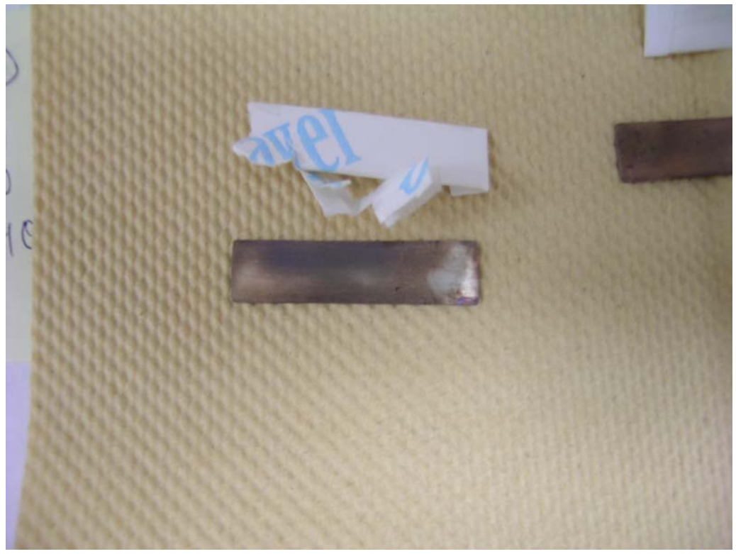
Silver Saver Paper