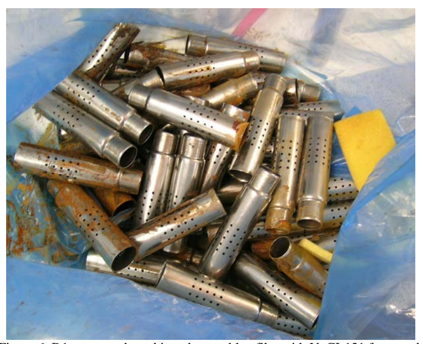
Figure 6: D1, parts packaged in unknown blue film with VpCI-131 foam pad, after 1000 hours in ASTM D-1748 humidity.