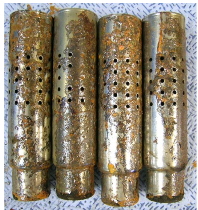
Figure 2: A1, control parts after 1000 hours in ASTM D-1748 humidity.