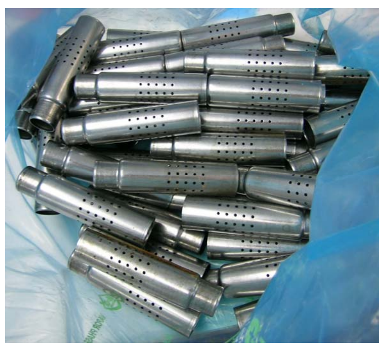
Figure 8: F1, parts packaged in 4-mil VpCI-126 film, after 1000 hours in ASTM D-1748 humidity.