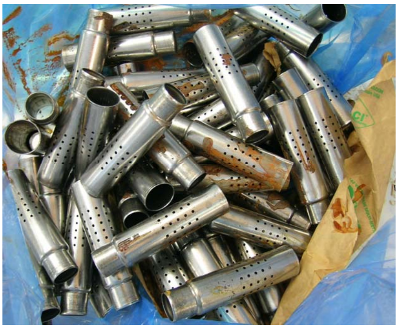
Figure 5: C1, parts packaged in unknown blue film with VpCI-146 paper, after 1000 hours in ASTM D-1748 humidity.