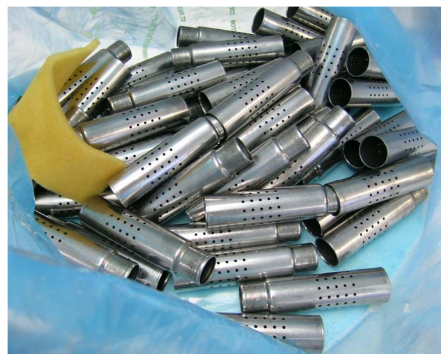
Figure 10: H1, parts packaged in 4-mil VpCI-126 and VpCI-131 foam, after 1000 hours in ASTM D-1748 humidity