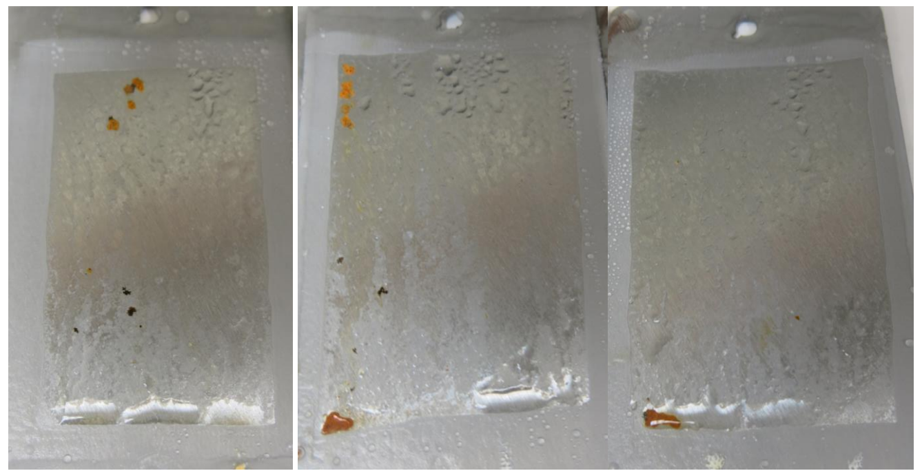
Picture 2: Panels 3, 4, and 5 after 525 hours of testing according to ASTM D-1735.