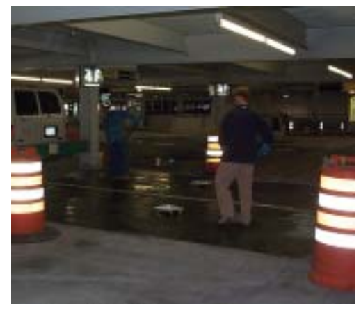
MCI 2020 has been included in a test on a parking ramp at La Guardia Airport in New York.

the preceding three days shall be recorded. The areas to be tested will be thoroughly wetted the day of testing. An evaluation will be made after one year to determine future testing. Surface frictional properties using an British Pendulum Tester (ASTM: E303) will also be performed after the migrating corrosion inhibitor has fully cured.