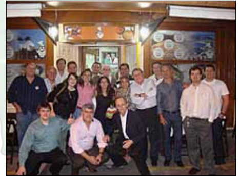
Attendees at the Cortec® Corporation South American Sales Meeting have a night on the town in Vitoria Brazil.

As part of the Latin American joyful spirit, the group celebrated old and new friendships. The richness of the multicultural and colorful -Spanish, Portuguese, 'portuñol', English- blend of languages and the exquisite Brazilian gastronomy were enjoyed by all.