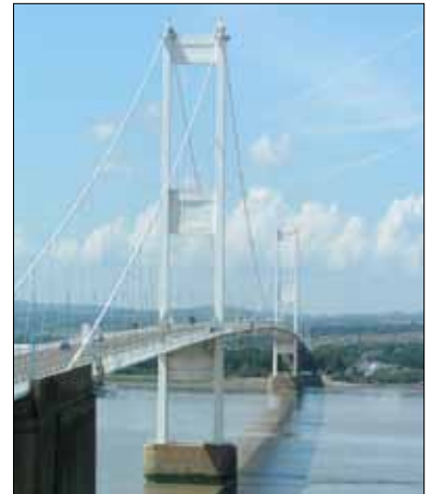
PTC Emitters were distributed around the cables of the Severn Bridge as needed.

The 10 innovations with the highest number of online votes will be announced at the NACE International CORROSION 2013 Conference and Exhibition in Orlando, Florida and recognized in MP magazine.