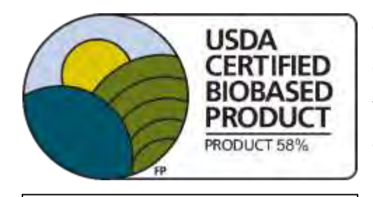
BioPad® USDA Certified Biobased Product

Cortec's "USDA Certified Biobased Products" present an especially exciting product portfolio that continues to grow. Cortec<sup>®</sup> offers a wide range of these products that contain renewable resources and offer solutions in the areas of cleaning and surface prep, construction, lubrication, water treatment, and more! Many of them have a special anti-corrosion aspect, such as Cortec's biobased rust