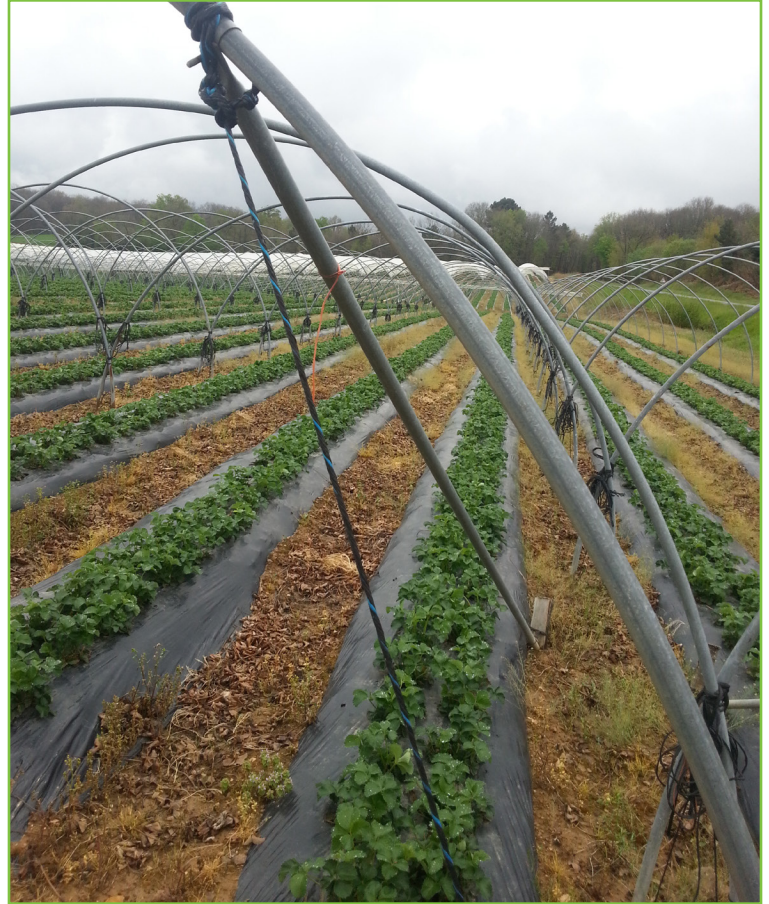
Organic Plus SP solutions on strawberry farm

Organic Plus SP has been approved for organic agriculture by Quebec Vrai (OCQV), an organic certification organization in Canada. All-natural components of Organic Plus SP make it an attractive replacement for traditional chemicals used to control disease and stimulate growth. By harnessing the natural strength of Organic Plus SP, it is possible to boost crop health and decrease losses in a more ecologically friendly way.