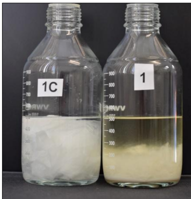
Bathroom Tissue at 2 Hours