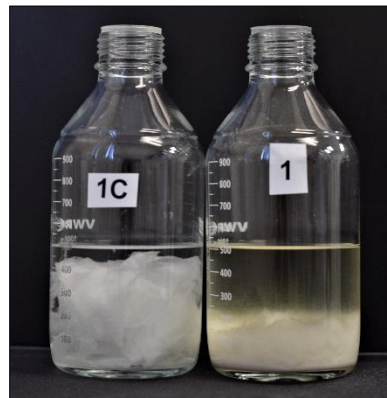
Bathroom Tissue at 18 Hours