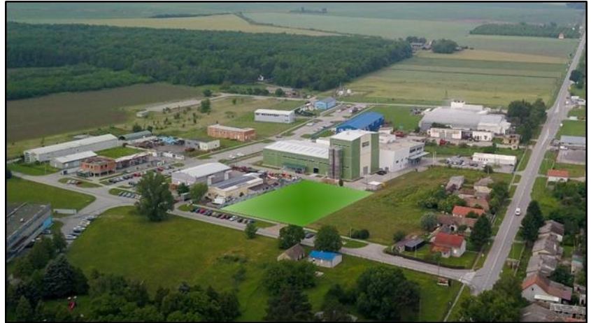
Production facilities, offices and accredited laboratory are located on the green EcoCortec complex in Beli Manastir, Croatia.