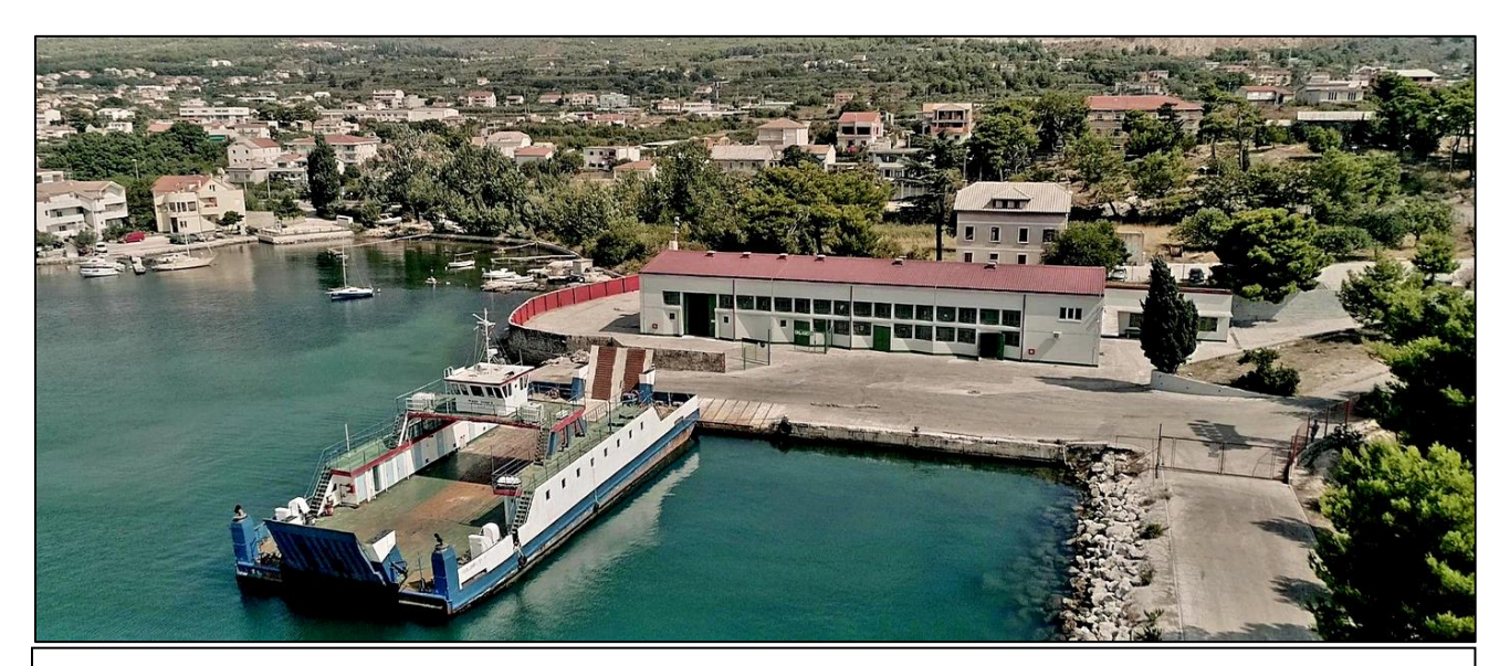
CorteCros's logistics and distribution center is strategically located in the port near Split, enabling fast shipment and distribution of Cortec's products throughout Europe and the world.

CorteCros® recently acquired a facility building in Split from CROSCO d.o.o., subsidiary of INA, a Croatian multinational oil company. The company is now the 100 percent owner of the logistics and distribution center in Split, which has recently expanded its production facility and storage capacity. Split is now Europe's main production and distribution point for Cortec's corrosion protection chemistries.