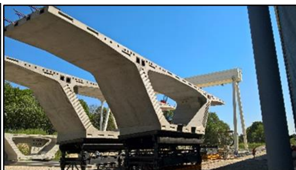
Bridge over the Roskilde Fjord, new Frederikssund bridge in Denmark. MCI® is used for corrosion protection of PT concrete segments.

Read about the Denmark bridge construction here: