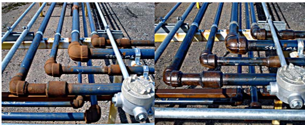
Propane gas lines before and after treatment with CorrVerter®

VpCI® CorrVerter® is advanced water-based converter and primer for Corrosion Protection. It is recommended for rusty or poorly prepared steel surfaces, where further corrosion protection is required, and good surface preparation is difficult to achieve. The product is formulated to penetrate and eliminate rust, and can easily be applied under varying weather conditions. It penetrates to the bare metal, and stops further rusting, providing a long-term corrosion protection.