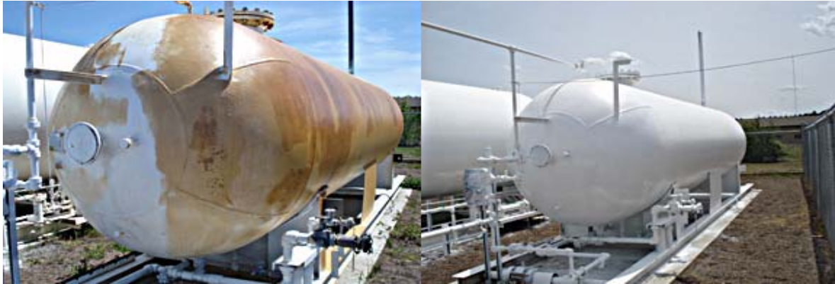
Results of Propane tanks restoration with CorrVerter®

water-based paints, unlike acid-based coatings, which can only be topcoated with solvent-based paints.