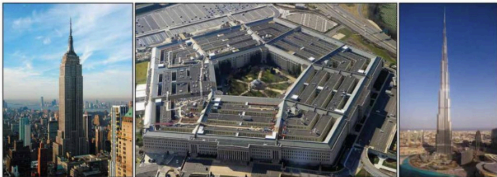
MCI® technology is utilized worldwide for the construction and rehabilitation of world most famous building structures such as the Empire State Building, Pentagon and Dubai's Burj Khalifa, tallest tower in the world.

Cortec Corporation signed the donation agreement with the Mayor of Croatian City of Vukovar. The company donated funds for reconstruction of Vukovar water tower that was almost destroyed in 90's during Croatian War of Independence. Water tower is the most famous symbol of city's suffering during the Battle of Vukovar but also victory and new life. It was one of the most frequent targets of artillery but never collapsed.