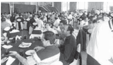
Lunch with clients is very appreciated in Mexico.

Registration includes coffee-break, Lunch, documents. Inscription rights : US$ 151 or € 115 Payment by card http://metalspain.com/paypal-mexico-fundicion.html or Bank transfer in Euros or US$