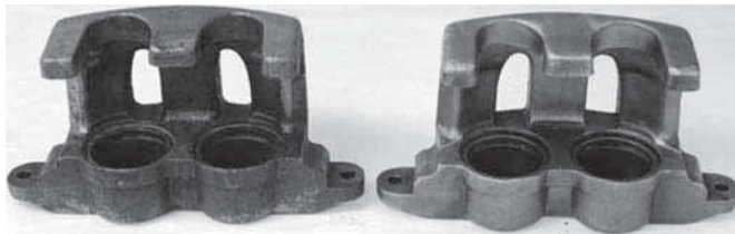
Non-toxic rust removers such as VpCl®-422 can effectively clean the rust off parts to restore them to usable condition on the same day.

With engineers focused on operations, this scenario is not as rare as it should be. Support services such as preservation of spares are often overlooked and considered of low priority. Too often, critical spares are stored with no protection at all. Responsibilities are divided between departments, and discussions on whose budget they fall under are protracted. This disastrous scenario can be avoided with a little forethought and planning, minimizing downtime and ensuring operations are kept running at peak performance.