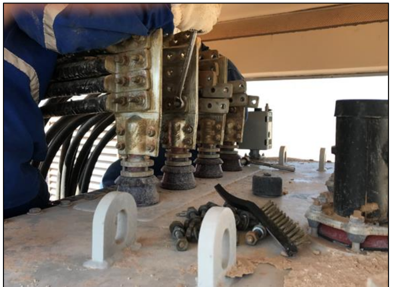
Corroded clamps in the transformer box were washed with VpCI®-415 and dried. ElectriCorr® VpCI®-239 was applied and they were bolted back into place. VpCI®-386 was used on the clamp external surfaces.

Corrosion of bolts that hold wind turbine towers to their concrete bases is a common problem at wind farms, especially those located in marine environments. This was the case at a new wind farm in Brazil, where the base bolts were corroding due to constant exposure to the extremely corrosive environment of strong wind and blowing sand near the ocean. Clamps inside individual transformer boxes next to the tower bases were also experiencing corrosion. To protect against future corrosion, the base bolts were cleaned with Cortec's VpCI®-418 and coated with VpCI®-368 prior to capping them off with a rubber gasket. Any severe rust on the base bolts or base flange faces was passivated with CorrVerter® Rust Converter Primer. The flange faces will also be top-coated with VpCI®-396 and VpCI®-384 as the customer works through its corrosion maintenance plan one wind tower at a time. The corroded clamps inside the transformer box were unbolted and cleaned with VpCI®-415 and dried. ElectriCorr® VpCI®-239 was applied before they were bolted back into place. VpCI®-386 was used to protect clamp external surfaces.