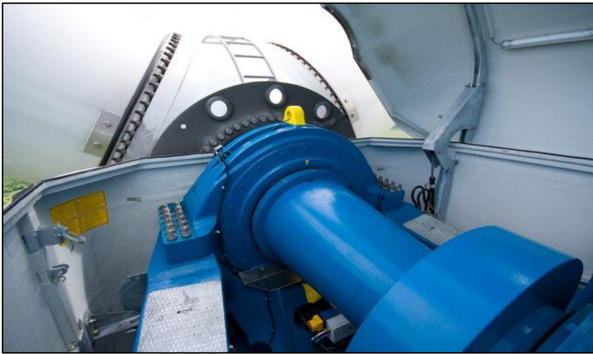
Modern wind turbines may comprise 1000 or more bolts that undergo rigid maintenance system.

Newly engineered systems are designed for up to 30 years of service; but exposure to environmental corrosion, UV rays, extreme temperatures, and salt corrosion are very challenging to component durability and quickly result in corrosion at vulnerable points. Excessive component failures can lead to high maintenance costs and underperformance of overall energy output. Fittings, solar cell support structures, wind generators, and heat exchangers are