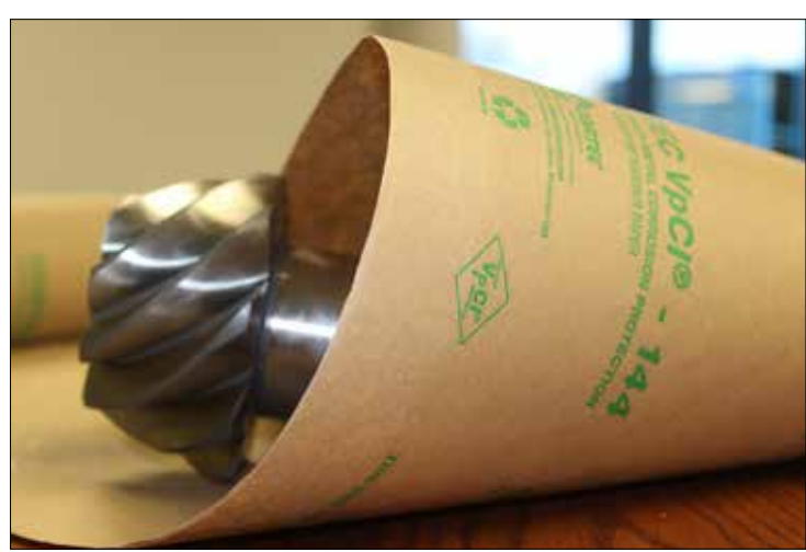
VpCI®-144 Moisture Barrier Paper