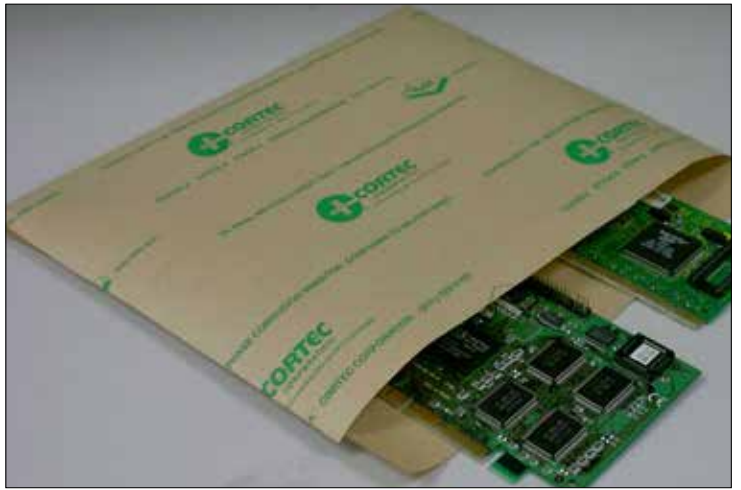
VpCI®-145 Static Dissipative Paper