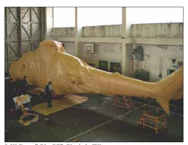
MilCorr® VpCI® Shrink Film

Cortec® Corporation has been included in two reports by the Freedonia industry research group: "Specialty Films" and "Active Intelligent Packaging"! These reports profile a number of Cortec's significant film and packaging contributions as a major player in these two markets.