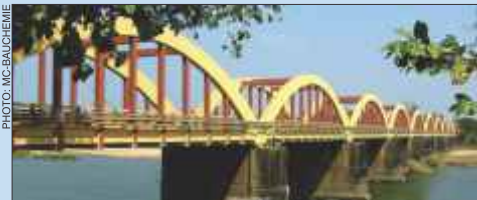
EmceColor-flex provides excellent protection for concrete subjected to adverse climatic conditions like in cooling towers, chimneys, bridges, buildings, etc.

resistance to diffusion of carbon dioxide and thus has anti-carbonation properties. In addition, EmceColor-flex is crack bridging, which is advantageous in case of repair and protection of cracked facades, exhibiting hairline and shrinkage