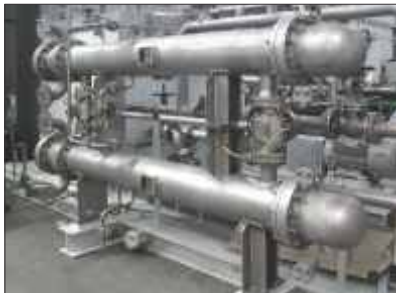
Cortec's VpCI®-371 is a high temperature aluminum solvent-borne silicone coating that provides excellent corrosion resistance on metal substrates.

VpCI®-371 is a high temperature aluminum solvent-borne silicone coating that provides excellent corrosion resistance on metal substrates. It will dry tack free to 5B hardness in about 20 minutes at room temperature and will achieve 9H hardness after heating. This is an ideal coating for applications that will reach high temperatures because the coating is heat stable to 1200°F with