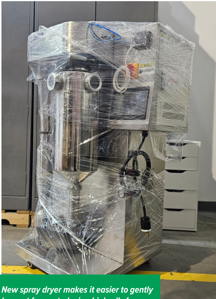
New spray dryer makes it easier to gently harvest fermented microbial cells for better downstream application analysis.