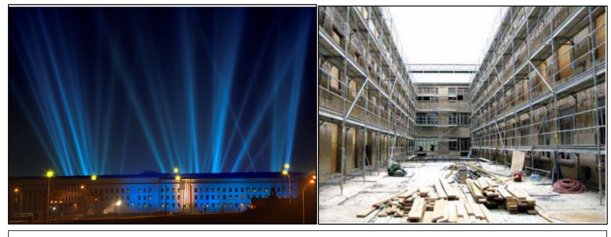
World's largest building Pentagon in Washington DC under repair using Cortec MCI<sup>®</sup>- 2020.

MCI<sup>®</sup> 2020 was chosen for renovation of Pentagon and has won International Concrete Repair Institute Award for the best repair project.