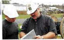
DESIGN & ENGINEERING