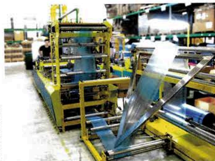
The films are used to protect metal parts and equipment from corrosion during storage and shipping.

ing a new production facility in Beli Manastir, Croatia to produce vapor-phase corrosion inhibitor films and bags. The new facility comes in response to a continuous increase in demand. The expansion project is being cofinanced by the Croatian Minis-