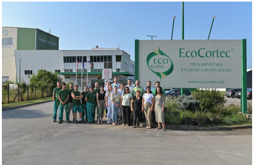
EcoCortec's team in front of Beli Manastir plant.

EcoCortec's success is built upon the vision, dedication, and hard work of our team and our customers' satisfaction is the driving force behind all of our future plans and accomplishments.