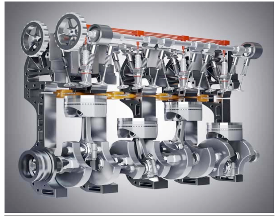
VpCI^{\circledR} -144 is ideal for wrapping various kinds of finished products: engines, machinery, equipment, tools, motors, etc.

Cortec VpCI®-144 is non-toxic, non-irritating, nitrite and amine free and fully recyclable/repulpable. It does not contain any silicones, chromates, other heavy metals or toxic products. That means it can be recycled into other types of paper products such as boxes, cardboard, and other corrugated materials. It can also be "repulped": made into or mixed with pulp to make new paper products.