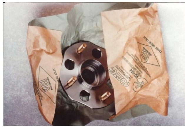
Cortec VpCI<sup>®</sup>-144 can now be printed at no charge with your company's logo for your brand protection! Free samples are available upon request.

Parts protected with Cortec® VpCI-144 can be painted, welded, and soldered. The thin protective film doesn't influence physical properties of most sensitive electrical and electronic components, including conductivity and resistivity.