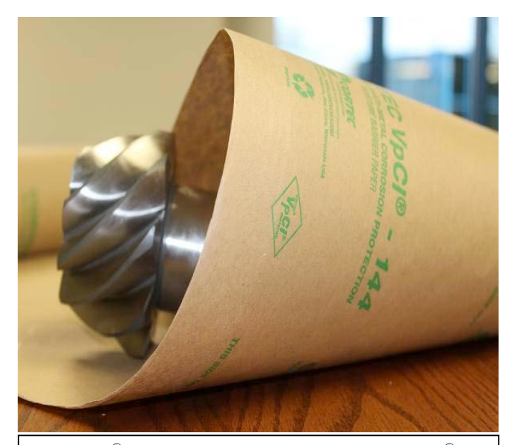
VpCI®-144 paper - powered by Nano VpCI®

Utilising high-tech, patented, recyclable and repulpable technology, Cortec<sup>®</sup> has produced a multimetal corrosion protection paper, VpCI<sup>®</sup>-144, powered by Nano VpCI<sup>®</sup>, the premium moisture barrier corrosion inhibiting paper in the industry.