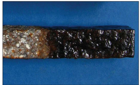
CorrVerter® MCI® Rust Primer is applied to the right side of the joint; the coating has converted the corrosion into a protective layer.