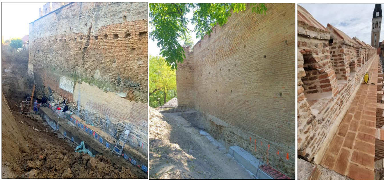
Excavation and preparation for strengthening the medieval city wall foundations, featuring a new concrete foundation enhanced with Cortec's MCI®-2005 to support the historic structures.

foundations, rebuilding collapsed sections, and injecting cracks to restore structural integrity. The project involved the use of corrosion inhibitors to prolong the life of the structure. MCI®-2005 was added to a new concrete foundation being used to support the old foundation. Special attention was given to protecting reinforcing metals in the concrete because of the new foundation's contact with the soil. Rather than using stainless steel reinforcement, the project opted for black steel reinforcement plus MCI®-2005. MCI®-2018 was applied to brick walls.