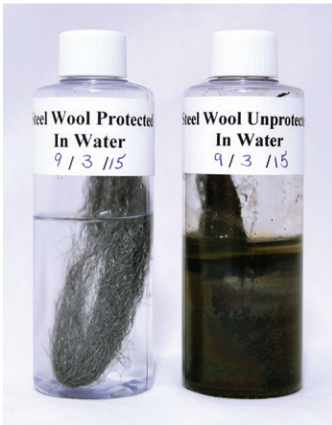
Water in the left bottle was treated with VpCI, which protected the steel wool in liquid and vapour phase, as well as at the air-water interface. The right bottle was untreated