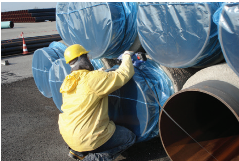
LNG pipes were end-capped with VpCI-126 film after internal fogging with VpCI. (Cortec Case History 311)

Once the piping is restored, it should then be preserved according to normal VpCI storage and shipping strategies to ensure continued protection.