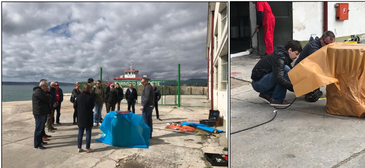
„Do it yourself“ method is always the best way to learn, that's why our distributors were eager to try shrink wrapping and fogging themselves.

Sharing mutual experiences is the best way to learn from each other and grow together in our Cortec® family. Two days of training camp didn't lack interesting discussions as this was the right place to ask questions and resolve any doubts