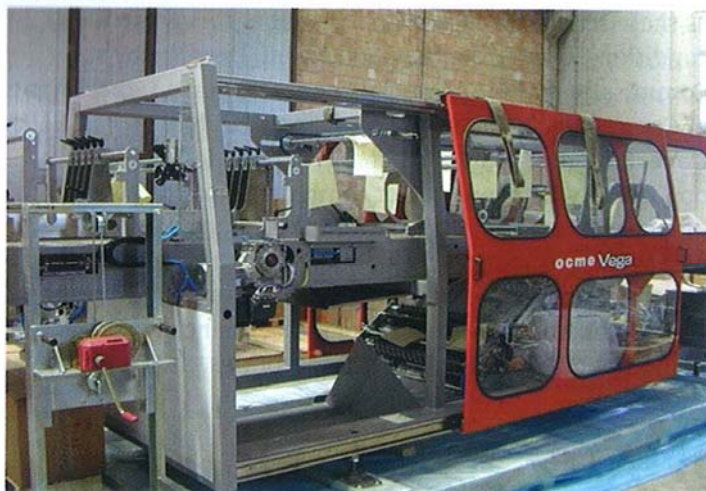
In transport corrosion protection using Cortec's VpCI ® 132 foam of shrink-wrapping machine for PET bottles.

VpCI ® -132 Impregnated Foam Pad is a unique, flexible packaging material that combines VpCI ® corrosion protection, cushioning and desiccant action, plus excellent antistatic capabilities - all in one step, enabling customers to eliminate expensive and messy rust preventatives. VpCI ® -132 is intended for export packaging of machinery, equipment and components. It is completely safe for the environment and does not contain harmful toxic compounds like nitrites and chromates.