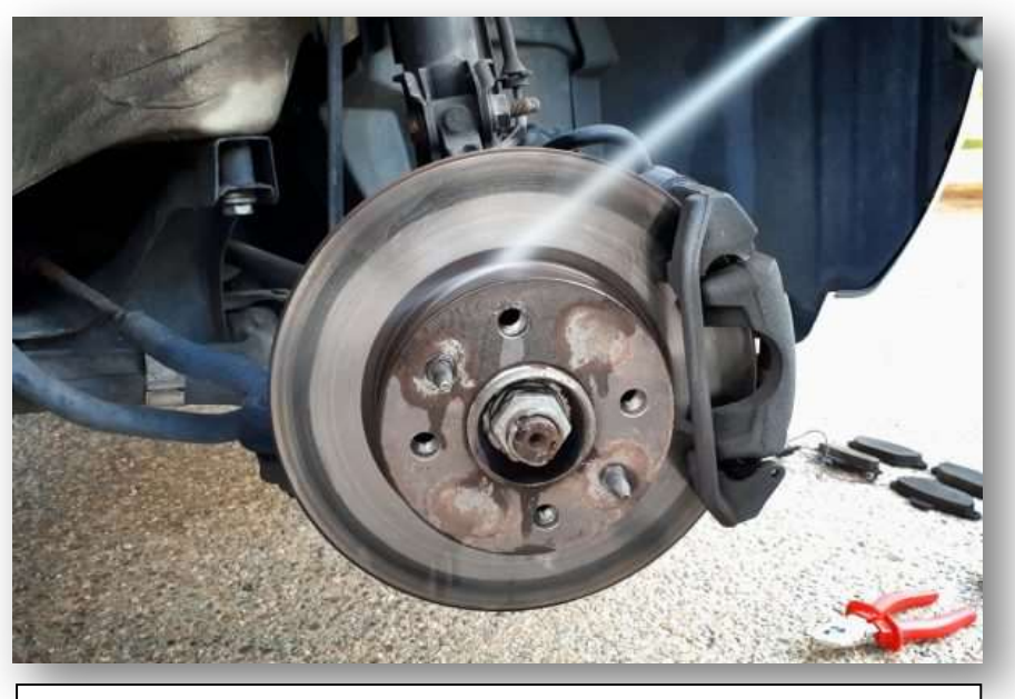
VpCI<sup>®</sup>-414 effectively removes dirt, oils, and greases or other cosmoline-like products.

preparation. This is because anticorrosion coatings are directly affected by the surface to which they are applied.