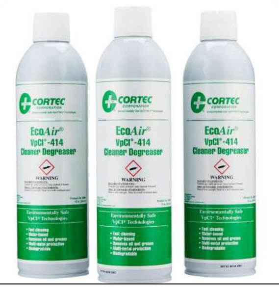
VpCI®-414 Cleaner Degreaser is also available in airpropelled EcoAir® aerosol spray cans.

A plant located in India manufactures a wide range of excavators. Before assembling the gearboxes, workers were cleaning the parts in the washing machine using an alkaline industrial cleaner at 5-6% concentration, maintaining the temperature at 65-70 °C (149-158 °F). Sump life of this cleaner was 30-45 days. After washing the parts, oil remained on the surface. This was unacceptable to the customer. They were searching for a cleaner with good cleaning ability, short-term rust protection, and an economical cost. Since they did not want to make many changes in the existing process, they introduced Cortec<sup>®</sup> VpCl<sup>®</sup>-414 to the washing